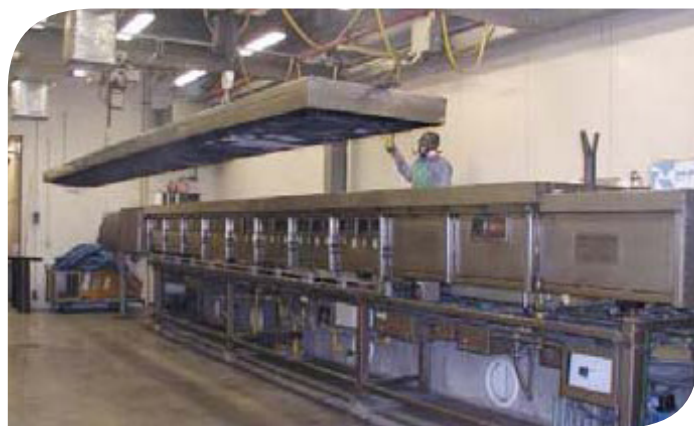
A facility conducting the Steiner Tunnel Test

To learn more about the Energy Efficient Coalition, please visit www.foaminsulationcoalition.org